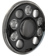
Part Number 0555711 24-110V LED Locomotive Headlight with Cool White leds. AU & ROW use