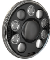
Part Number 0554601 24-110V LED Locomotive Headlight with Spot Beam Pattern