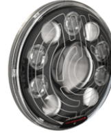
Part Number 0556571 24-110V LED Locomotive Headlight with Cool White leds & Heated Lens. AU & ROW use.