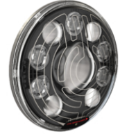
Part Number 0561031 24-110V LED Locomotive Headlight with Warm White Spot Beam Pattern & Heated Lens