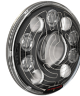
Part Number 0556571 24-110V LED Locomotive Headlight with Cool White leds & Heated Lens. AU & ROW use.