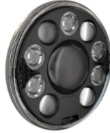
Part Number 0555711 24-110V LED Locomotive Headlight with Cool White leds. AU & ROW use