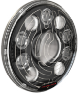
Part Number 0551901 24-110V LED Locomotive Headlight with Spot Beam Pattern & Heated Lens