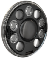
Part Number 0561051 24-110V LED Locomotive Headlight with Warm White leds with no EOL. AU & ROW use