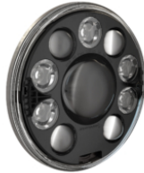
Part Number 0561061 24-110V LED Locomotive Headlight with Warm White Spot Beam Pattern