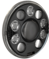
Part Number 0554601 24-110V LED Locomotive Headlight with Spot Beam Pattern