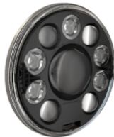
Part Number 0561061 24-110V LED Locomotive Headlight with Warm White Spot Beam Pattern