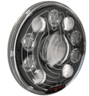
Part Number 0561041 24-110V LED Locomotive Headlight with Warm White leds and Heated Lens with no EOL. AU & ROW use