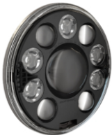
Part Number 0561051 24-110V LED Locomotive Headlight with Warm White leds with no EOL. AU & ROW use