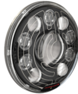
Part Number 0556571 24-110V LED Locomotive Headlight with Cool White leds & Heated Lens. AU & ROW use.