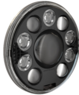
Part Number 0555711 24-110V LED Locomotive Headlight with Cool White leds. AU & ROW use