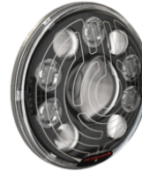
Part Number 0561031 24-110V LED Locomotive Headlight with Warm White Spot Beam Pattern & Heated Lens