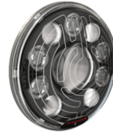
Part Number 0561041 24-110V LED Locomotive Headlight with Warm White leds and Heated Lens with no EOL. AU & ROW use