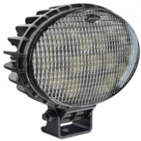
Part Number 1801571 12-24V LED Work Light with Polycarbonate Lens & Trapezoid Beam Pattern