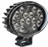
Part Number 1801621 12-24V LED Work Light with Polycarbonate Lens & Spot Beam Pattern