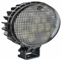
Part Number 1801571 12-24V LED Work Light with Polycarbonate Lens & Trapezoid Beam Pattern