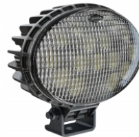
Part Number 1801781 12-24V LED Work Light with Glass Lens & Trapezoid Beam Pattern