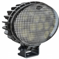
Part Number 1801581 12-24V LED Work Light with Polycarbonate Lens & Flood Beam Pattern