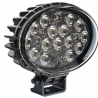
Part Number 1801621 12-24V LED Work Light with Polycarbonate Lens & Spot Beam Pattern