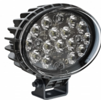
Part Number 1801621 12-24V LED Work Light with Polycarbonate Lens & Spot Beam Pattern