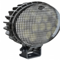
Part Number 1801781 12-24V LED Work Light with Glass Lens & Trapezoid Beam Pattern