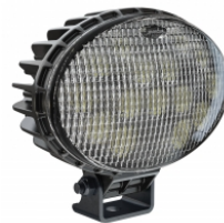
Part Number 1801781 12-24V LED Work Light with Glass Lens & Trapezoid Beam Pattern