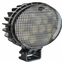
Part Number 1801581 12-24V LED Work Light with Polycarbonate Lens & Flood Beam Pattern