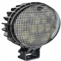
Part Number 1801571 12-24V LED Work Light with Polycarbonate Lens & Trapezoid Beam Pattern