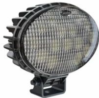
Part Number 1801581 12-24V LED Work Light with Polycarbonate Lens & Flood Beam Pattern