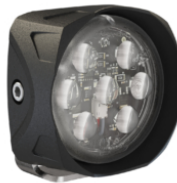
Part Number 0554871 12V LED Work Light with Trapezoid Beam Pattern