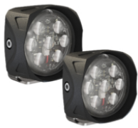
Part Number 0554863 12V LED Work Light Kit with Spot Beam Pattern - Kit of 2