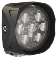
Part Number 0554861 12V LED Work Light with Spot Beam Pattern