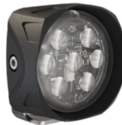
Part Number 0554871 12V LED Work Light with Trapezoid Beam Pattern