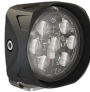
Part Number 0554871 12V LED Work Light with Trapezoid Beam Pattern