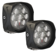
Part Number 0554863 12V LED Work Light Kit with Spot Beam Pattern