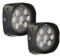
Part Number 0554863 12V LED Work Light Kit with Spot Beam Pattern