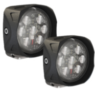
Part Number 0554863 12V LED Work Light Kit with Spot Beam Pattern - Kit of 2