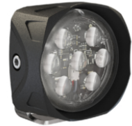
Part Number 0555001 12V LED Work Light with Flood Beam Pattern