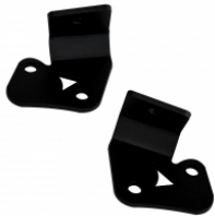
Part Number 6149203 A-Pillar Mounting Kit for Jeep JK