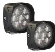
Part Number 0554873 12V LED Work Light Kit with Trapezoid Beam Pattern