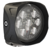
Part Number 0555001 12V LED Work Light with Flood Beam Pattern