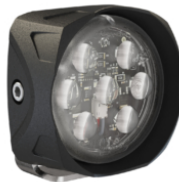
Part Number 0554871 12V LED Work Light with Trapezoid Beam Pattern