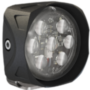
Part Number 0554861 12V LED Work Light with Spot Beam Pattern