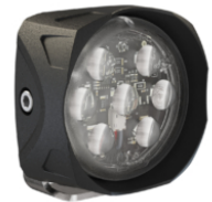
Part Number 0555001 12V LED Work Light with Flood Beam Pattern