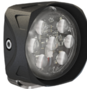
Part Number 0554871 12V LED Work Light with Trapezoid Beam Pattern