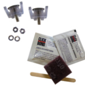
Part Number 8200491 Mounting Kit For Work Lights