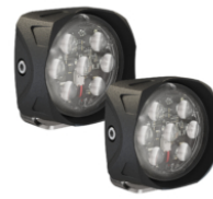
Part Number 0554873 12V LED Work Light Kit with Trapezoid Beam Pattern