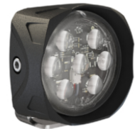
Part Number 0555001 12V LED Work Light with Flood Beam Pattern