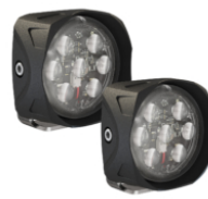
Part Number 0554873 12V LED Work Light Kit with Trapezoid Beam Pattern - Kit of 2