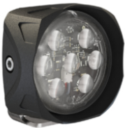
Part Number 0554861 12V LED Work Light with Spot Beam Pattern