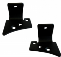
Part Number 6149233 A-Pillar Mounting Kit for Jeep TJ