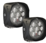
Part Number 0554873 12V LED Work Light Kit with Trapezoid Beam Pattern