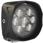
Part Number 0554861 12V LED Work Light with Spot Beam Pattern