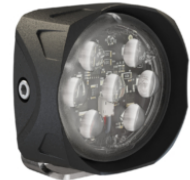
Part Number 0555001 12V LED Work Light with Flood Beam Pattern