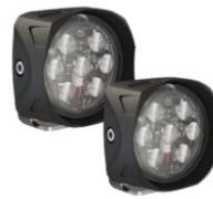
Part Number 0554873 12V LED Work Light Kit with Trapezoid Beam Pattern - Kit of 2