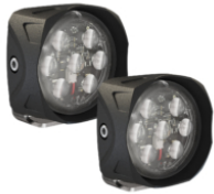
Part Number 0554863 12V LED Work Light Kit with Spot Beam Pattern