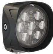
Part Number 0554871 12V LED Work Light with Trapezoid Beam Pattern