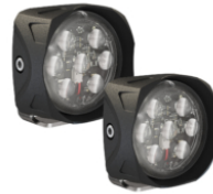
Part Number 0554873 12V LED Work Light Kit with Trapezoid Beam Pattern