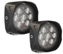
Part Number 0555003 12V LED Work Light Kit with Flood Beam Pattern