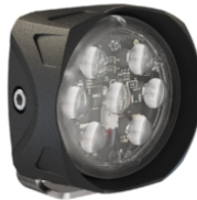
Part Number 0554871 12V LED Work Light with Trapezoid Beam Pattern