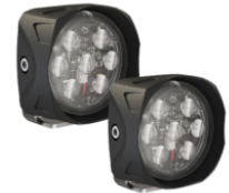
Part Number 0555003 12V LED Work Light Kit with Flood Beam Pattern