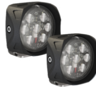
Part Number 0554873 12V LED Work Light Kit with Trapezoid Beam Pattern