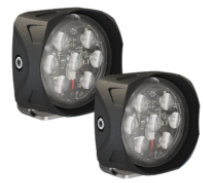
Part Number 0555003 12V LED Work Light Kit with Flood Beam Pattern - Kit of 2