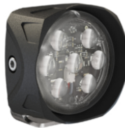
Part Number 0554871 12V LED Work Light with Trapezoid Beam Pattern