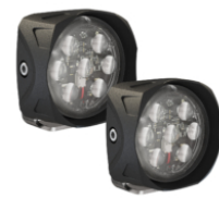
Part Number 0555003 12V LED Work Light Kit with Flood Beam Pattern