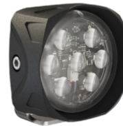
Part Number 0555001 12V LED Work Light with Flood Beam Pattern