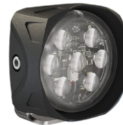
Part Number 0555001 12V LED Work Light with Flood Beam Pattern