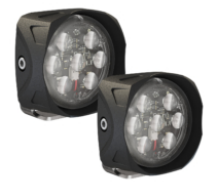
Part Number 0555003 12V LED Work Light Kit with Flood Beam Pattern