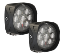
Part Number 0555003 12V LED Work Light Kit with Flood Beam Pattern