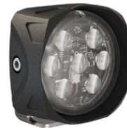
Part Number 0555001 12V LED Work Light with Flood Beam Pattern