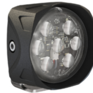
Part Number 0555001 12V LED Work Light with Flood Beam Pattern