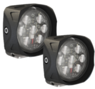
Part Number 0554863 12V LED Work Light Kit with Spot Beam Pattern - Kit of 2