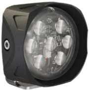
Part Number 0554861 12V LED Work Light with Spot Beam Pattern