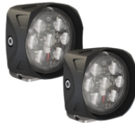
Part Number 0554873 12V LED Work Light Kit with Trapezoid Beam Pattern