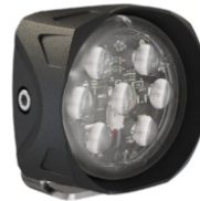
Part Number 0555001 12V LED Work Light with Flood Beam Pattern