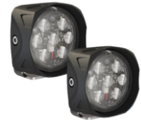
Part Number 0555003 12V LED Work Light Kit with Flood Beam Pattern