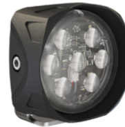
Part Number 0555001 12V LED Work Light with Flood Beam Pattern