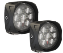
Part Number 0555003 12V LED Work Light Kit with Flood Beam Pattern