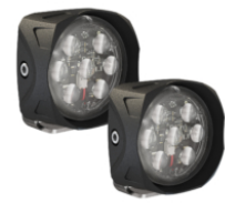
Part Number 0555003 12V LED Work Light Kit with Flood Beam Pattern - Kit of 2