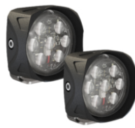
Part Number 0554873 12V LED Work Light Kit with Trapezoid Beam Pattern - Kit of 2