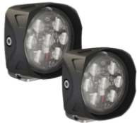
Part Number 0554863 12V LED Work Light Kit with Spot Beam Pattern