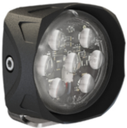
Part Number 0554861 12V LED Work Light with Spot Beam Pattern