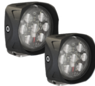
Part Number 0554873 12V LED Work Light Kit with Trapezoid Beam Pattern