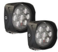
Part Number 0555003 12V LED Work Light Kit with Flood Beam Pattern - Kit of 2