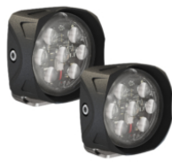
Part Number 0554873 12V LED Work Light Kit with Trapezoid Beam Pattern - Kit of 2