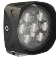
Part Number 0555001 12V LED Work Light with Flood Beam Pattern