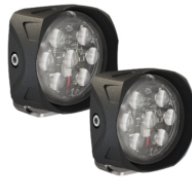
Part Number 0554873 12V LED Work Light Kit with Trapezoid Beam Pattern - Kit of 2