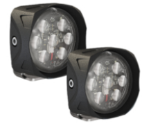
Part Number 0555003 12V LED Work Light Kit with Flood Beam Pattern - Kit of 2