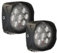
Part Number 0554863 12V LED Work Light Kit with Spot Beam Pattern - Kit of 2