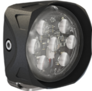
Part Number 0554871 12V LED Work Light with Trapezoid Beam Pattern