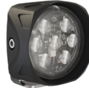
Part Number 0555001 12V LED Work Light with Flood Beam Pattern