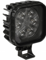
Part Number 1300181 12-24V LED Auxiliary Light with Flood Beam Pattern