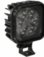
Part Number 1300611 24V LED Auxiliary Light with Trapezoid Beam Pattern