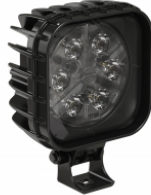
Part Number 1300171 12-24V LED Auxiliary Light with Trapezoid Beam Pattern