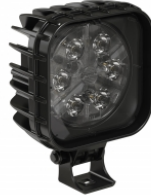
Part Number 1300181 12-24V LED Auxiliary Light with Flood Beam Pattern