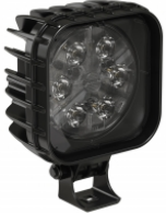
Part Number 1300161 12-24V LED Auxiliary Light with Spot Beam Pattern