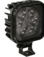
Part Number 1300611 24V LED Auxiliary Light with Trapezoid Beam Pattern