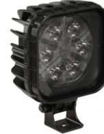
Part Number 1300621 24V LED Auxiliary Light with Flood Beam Pattern