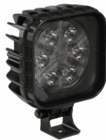
Part Number 1300171 12-24V LED Auxiliary Light with Trapezoid Beam Pattern