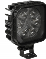
Part Number 1300621 24V LED Auxiliary Light with Flood Beam Pattern