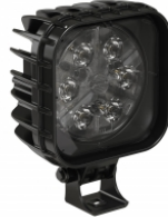
Part Number 1300611 24V LED Auxiliary Light with Trapezoid Beam Pattern