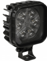
Part Number 1300611 24V LED Auxiliary Light with Trapezoid Beam Pattern