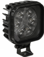
Part Number 1300171 12-24V LED Auxiliary Light with Trapezoid Beam Pattern