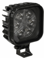
Part Number 1300161 12-24V LED Auxiliary Light with Spot Beam Pattern