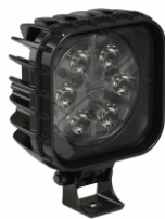
Part Number 1300171 12-24V LED Auxiliary Light with Trapezoid Beam Pattern