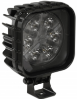
Part Number 1300161 12-24V LED Auxiliary Light with Spot Beam Pattern