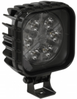
Part Number 1300161 12-24V LED Auxiliary Light with Spot Beam Pattern