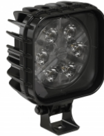
Part Number 1300611 24V LED Auxiliary Light with Trapezoid Beam Pattern