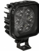
Part Number 1300621 24V LED Auxiliary Light with Flood Beam Pattern