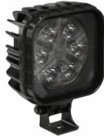
Part Number 1300171 12-24V LED Auxiliary Light with Trapezoid Beam Pattern