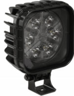
Part Number 1300181 12-24V LED Auxiliary Light with Flood Beam Pattern