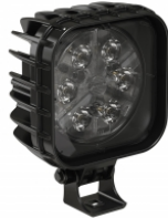
Part Number 1300181 12-24V LED Auxiliary Light with Flood Beam Pattern