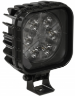
Part Number 1300161 12-24V LED Auxiliary Light with Spot Beam Pattern