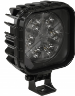
Part Number 1300611 24V LED Auxiliary Light with Trapezoid Beam Pattern