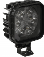
Part Number 1300611 24V LED Auxiliary Light with Trapezoid Beam Pattern