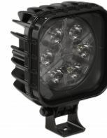
Part Number 1300621 24V LED Auxiliary Light with Flood Beam Pattern