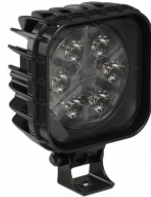
Part Number 1300181 12-24V LED Auxiliary Light with Flood Beam Pattern