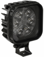
Part Number 1300171 12-24V LED Auxiliary Light with Trapezoid Beam Pattern