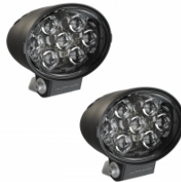
Part Number 0550693 12-24V ECE LED Auxiliary Light with Driving Beam - 2 Light Kit