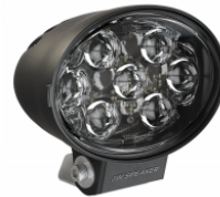
Part Number 0550711 12-24V LED Auxiliary Light with Pencil Beam Auxiliary Light - 1 Light