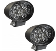
Part Number 0550713 12-24V LED Auxiliary Light with Pencil Beam - 2 Light Kit