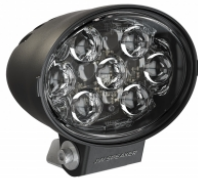
Part Number 0550691 12-24V ECE LED Auxiliary Light with Driving Beam - 1 Light