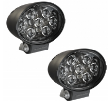
Part Number 0550713 12-24V LED Auxiliary Light with Pencil Beam - 2 Light Kit