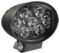
Part Number 0550671 12-24V DOT LED Auxiliary Light with Driving Beam - 1 Light