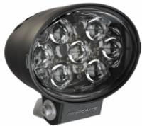
Part Number 0550671 12-24V DOT LED Auxiliary Light with Driving Beam - 1 Light