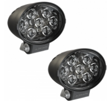
Part Number 0550713 12-24V LED Auxiliary Light with Pencil Beam - 2 Light Kit