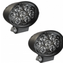
Part Number 0550693 12-24V ECE LED Auxiliary Light with Driving Beam - 2 Light Kit