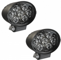
Part Number 0550673 12-24V DOT LED Auxiliary Light with Driving Beam - 2 Light Kit