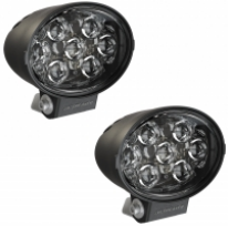
Part Number 0550673 12-24V DOT LED Auxiliary Light with Driving Beam - 2 Light Kit