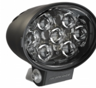
Part Number 0550711 12-24V LED Auxiliary Light with Pencil Beam Auxiliary Light - 1 Light Kit