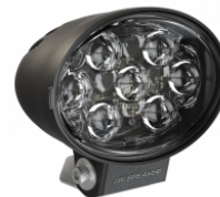
Part Number 0550711 12-24V LED Auxiliary Light with Pencil Beam Auxiliary Light - 1 Light Kit