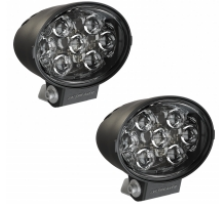
Part Number 0550713 12-24V LED Auxiliary Light with Pencil Beam - 2 Light Kit