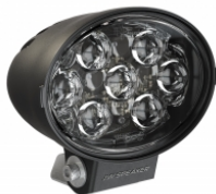
Part Number 0550691 12-24V ECE LED Auxiliary Light with Driving Beam - 1 Light Kit