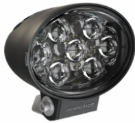
Part Number 0550691 12-24V ECE LED Auxiliary Light with Driving Beam - 1 Light Kit