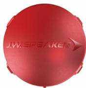
Part Number 5874291 Red Replacement Lens Cover for Model TS3001R