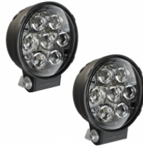
Part Number 0550463 12-24V ECE LED Auxiliary Light with Driving Beam - 2 Light Kit