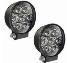
Part Number 0550483 12-24V LED Auxiliary Light with Pencil Beam - 2 Light Kit