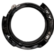
Part Number 5868181 Single Mounting Ring (Left Hand Side) for 2017 Jeeps 7" Round Headlights