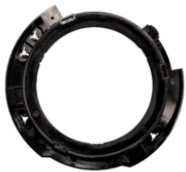
Part Number 5868171 Single Mounting Ring (Right Hand Side) for 2017 Jeeps 7" Round Headlights