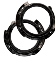
Part Number 8200461 Mounting Ring Kit for 2017-18 Jeep JK 7" Round Headlights