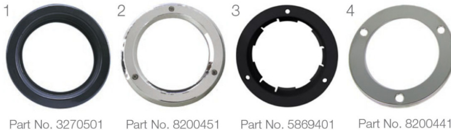
Part No. 3270501