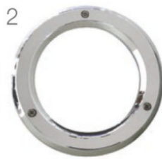
Part No. 8200451