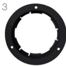
Part No. 5869401