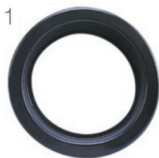
Part No. 3270501