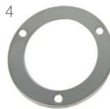
Part No. 8200441