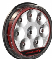
Part Number 0347861 12-24V DOT LED Non- Heated Red Stop, Tail, & Turn Light