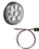
Part Number 0346474 12-24V DOT LED Heated White Reverse Light Kit with Harness