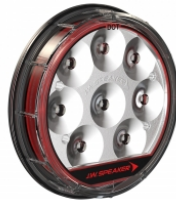
Part Number 0346421 12-48V DOT LED Non- Heated White Stop & Tail Light