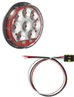
Part Number 0346264 12-24V DOT LED Heated Red Stop, Tail, & Turn Light Kit with Harness