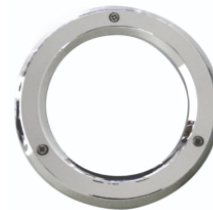
Part Number 8200451 4" Round Chrome Plastic Trim Ring for Model 234