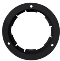
Part Number 5869401 4" Round Plastic Mounting Flange for Model 234