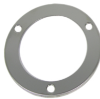
Part Number 8200441 4" Round Stainless Steel Trim Ring for Model 234