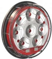
Part Number 0346261 12-24V DOT LED Heated Red Stop, Tail, & Turn Light