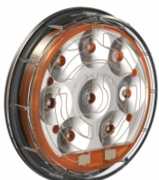
Part Number 0347811 12-24V DOT LED Heated Amber Turn Signal