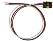
Part Number 3270501 3-Pin AMP Connector Wire Harness Assembly