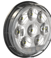
Part Number 0346471 12-24V DOT LED Heated White Reverse Light