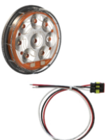
Part Number 0347814 12-24V DOT LED Heated Amber Turn Signal Kit with Harness