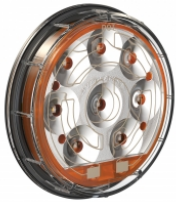
Part Number 0347811 12-24V DOT LED Heated Amber Turn Signal