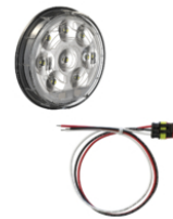
Part Number 0346474 12-24V DOT LED Heated White Reverse Light Kit with Harness