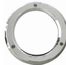
Part Number 8200451 4" Round Chrome Plastic Trim Ring for Model 234