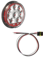
Part Number 0346264 12-24V DOT LED Heated Red Stop, Tail, & Turn Light Kit with Harness