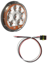
Part Number 0347814 12-24V DOT LED Heated Amber Turn Signal Kit with Harness