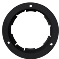
Part Number 5869401 4" Round Plastic Mounting Flange for Model 234