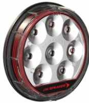
Part Number 0347861 12-24V DOT LED Non- Heated Red Stop, Tail, & Turn Light