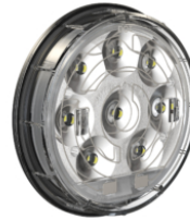
Part Number 0346471 12-24V DOT LED Heated White Reverse Light