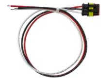
Part Number 3270501 3-Pin AMP Connector Wire Harness Assembly