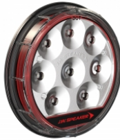
Part Number 0346421 12-48V DOT LED Non- Heated Stop & Tail Light