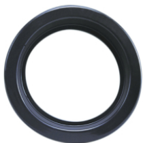
Part Number 4242731 4" Round Rubber Mounting Grommet for Model 234