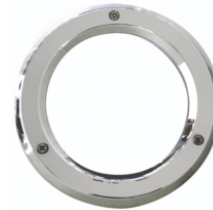
Part Number 8200451 4" Round Chrome Plastic Trim Ring for Model 234