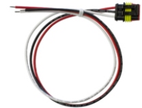
Part Number 3270501 3-Pin AMP Connector Wire Harness Assembly