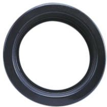
Part Number 4242731 4" Round Rubber Mounting Grommet for Model 234