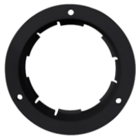
Part Number 5869401 4" Round Plastic Mounting Flange for Model 234