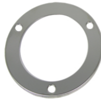
Part Number 8200441 4" Round Stainless Steel Trim Ring for Model 234