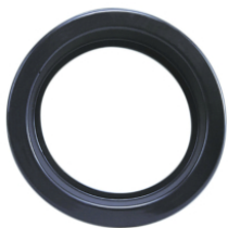
Part Number 4242731 4" Round Rubber Mounting Grommet for Model 234