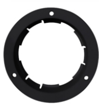
Part Number 5869401 4" Round Plastic Mounting Flange for Model 234