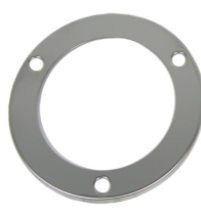
Part Number 8200441 4" Round Stainless Steel Trim Ring for Model 234