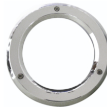
Part Number 8200451 4" Round Chrome Plastic Trim Ring for Model 234