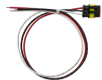
Part Number 3270501 3-Pin AMP Connector Wire Harness Assembly