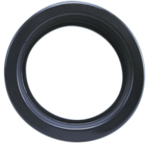
Part Number 4242731 4" Round Rubber Mounting Grommet for Model 234