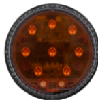
Part Number 0443761 12-24V ECE DOT Reverse Light