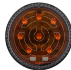
Part Number 0647431 12-24V DOT Flashing Lamp - Amber - with Heat