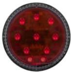
Part Number 0348811 12-24V ECE DOT Stop Tail Turn Lamp - Stud Mounted