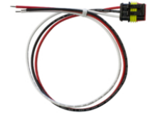
Part Number 3270501 3-Pin AMP Connector Wire Harness Assembly