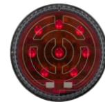
Part Number 0348801 12-24V ECE DOT Stop Tail Turn Lamp - Stud Mounted - with Heat