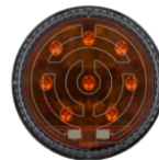
Part Number 0647431 12-24V DOT Flashing Lamp - Amber - with Heat