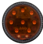
Part Number 0348771 12-24V ECE DOT Turn Signal Light