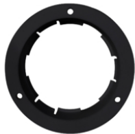
Part Number 5869401 4" Round Plastic Mounting Flange for Model 234