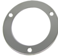
Part Number 8200441 4" Round Stainless Steel Trim Ring for Model 234