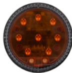
Part Number 0348771 12-24V ECE DOT Turn Signal Light