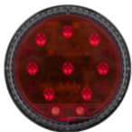
Part Number 0348811 12-24V ECE DOT Stop Tail Turn Lamp - Stud Mounted