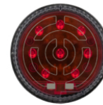
Part Number 0348801 12-24V ECE DOT Stop Tail Turn Lamp - Stud Mounted - with Heat