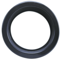
Part Number 4242731 4" Round Rubber Mounting Grommet for Model 234