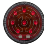
Part Number 0348781 12-24V ECE DOT Stop Tail Turn Lamp - with Heat