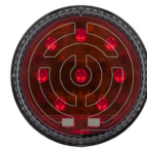
Part Number 0348781 12-24V ECE DOT Stop Tail Turn Lamp - with Heat