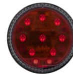
Part Number 0348791 12-24V ECE DOT Stop Tail Turn Lamp