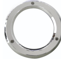
Part Number 8200451 4" Round Chrome Plastic Trim Ring for Model 234