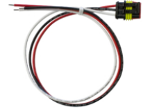
Part Number 3270501 3-Pin AMP Connector Wire Harness Assembly