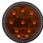
Part Number 0443761 12-24V ECE DOT Reverse Light