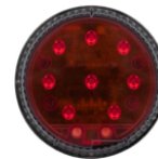
Part Number 0348791 12-24V ECE DOT Stop Tail Turn Lamp