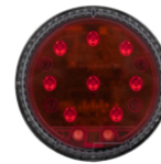
Part Number 0348791 12-24V ECE DOT Stop Tail Turn Lamp