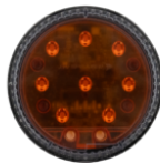
Part Number 0348771 12-24V ECE DOT Turn Signal Light