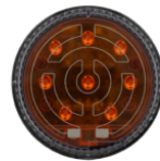
Part Number 0647431 12-24V DOT Flashing Lamp - Amber - with Heat