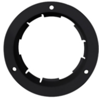
Part Number 5869401 4" Round Plastic Mounting Flange for Model 234