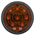
Part Number 0348761 12-24V ECE DOT Turn Signal Light - with Heat