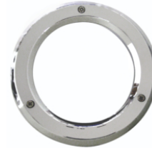
Part Number 8200451 4" Round Chrome Plastic Trim Ring for Model 234