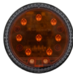
Part Number 0443761 12-24V ECE DOT Reverse Light