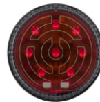
Part Number 0348781 12-24V ECE DOT Stop Tail Turn Lamp - with Heat