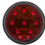
Part Number 0348791 12-24V ECE DOT Stop Tail Turn Lamp