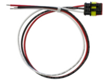
Part Number 3270501 3-Pin AMP Connector Wire Harness Assembly