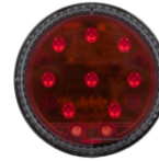
Part Number 0348811 12-24V ECE DOT Stop Tail Turn Lamp - Stud Mounted