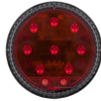
Part Number 0348791 12-24V ECE DOT Stop Tail Turn Lamp