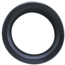
Part Number 4242731 4" Round Rubber Mounting Grommet for Model 234