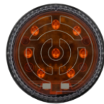
Part Number 0647431 12-24V DOT Flashing Lamp - Amber - with Heat