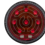
Part Number 0348801 12-24V ECE DOT Stop Tail Turn Lamp - Stud Mounted - with Heat