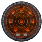
Part Number 0443751 12-24V ECE DOT Reverse Light - with Heat