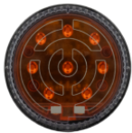
Part Number 0348761 12-24V ECE DOT Turn Signal Light - with Heat