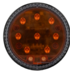
Part Number 0443761 12-24V ECE DOT Reverse Light