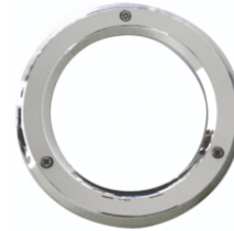
Part Number 8200451 4" Round Chrome Plastic Trim Ring for Model 234