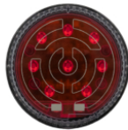
Part Number 0348781 12-24V ECE DOT Stop Tail Turn Lamp - with Heat