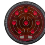
Part Number 0348801 12-24V ECE DOT Stop Tail Turn Lamp - Stud Mounted - with Heat