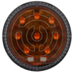
Part Number 0348761 12-24V ECE DOT Turn Signal Light - with Heat