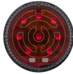
Part Number 0348781 12-24V ECE DOT Stop Tail Turn Lamp - with Heat