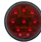
Part Number 0348811 12-24V ECE DOT Stop Tail Turn Lamp - Stud Mounted