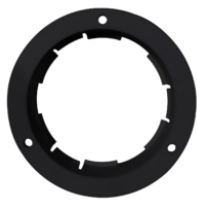
Part Number 5869401 4" Round Plastic Mounting Flange for Model 234