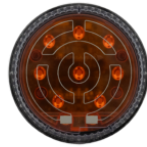
Part Number 0647431 12-24V DOT Flashing Lamp - Amber - with Heat