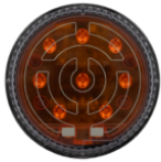
Part Number 0443751 12-24V ECE DOT Reverse Light - with Heat