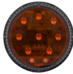
Part Number 0443761 12-24V ECE DOT Reverse Light