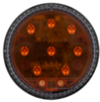
Part Number 0348771 12-24V ECE DOT Turn Signal Light