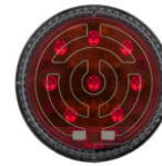
Part Number 0348801 12-24V ECE DOT Stop Tail Turn Lamp - Stud Mounted - with Heat