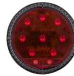
Part Number 0348811 12-24V ECE DOT Stop Tail Turn Lamp - Stud Mounted