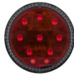
Part Number 0348791 12-24V ECE DOT Stop Tail Turn Lamp