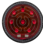
Part Number 0348781 12-24V ECE DOT Stop Tail Turn Lamp - with Heat