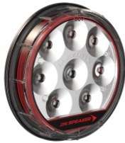
Part Number 0347861 12-24V DOT LED Non- Heated Red Stop, Tail, & Turn Light