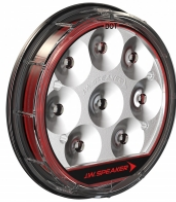
Part Number 0346421 12-48V DOT LED Non- Heated Stop & Tail Light