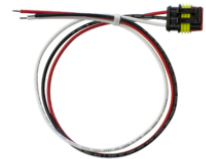
Part Number 3270501 3-Pin AMP Connector Wire Harness Assembly