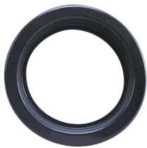
Part Number 4242731 4" Round Rubber Mounting Grommet for Model 234