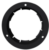
Part Number 5869401 4" Round Plastic Mounting Flange for Model 234