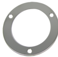
Part Number 8200441 4" Round Stainless Steel Trim Ring for Model 234