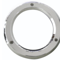
Part Number 8200451 4" Round Chrome Plastic Trim Ring for Model 234