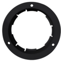
Part Number 5869401 4" Round Plastic Mounting Flange for Model 234