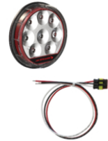
Part Number 0347864 12-24V DOT LED Non- Heated Red Stop, Tail, & Turn Light Kit with Harness