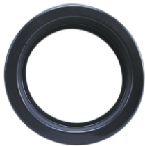
Part Number 4242731 4" Round Rubber Mounting Grommet for Model 234