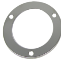
Part Number 8200441 4" Round Stainless Steel Trim Ring for Model 234