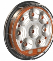
Part Number 0347811 12-24V DOT LED Heated Amber Turn Signal