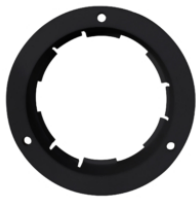
Part Number 5869401 4" Round Plastic Mounting Flange for Model 234