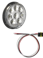
Part Number 0346474 12-24V DOT LED Heated White Reverse Light Kit with Harness