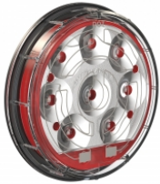
Part Number 0346261 12-24V DOT LED Heated Red Stop, Tail, & Turn Light