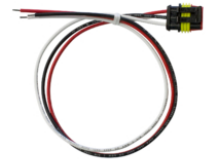
Part Number 3270501 3-Pin AMP Connector Wire Harness Assembly