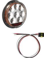
Part Number 0347874 12-24V DOT LED Non- Heated Turn Signal Kit with Harness