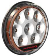
Part Number 0347871 12-24V DOT LED Non- Heated Turn Signal