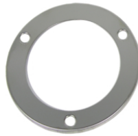
Part Number 8200441 4" Round Stainless Steel Trim Ring for Model 234