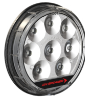
Part Number 0347881 12-24V DOT LED Non- Heated Reverse Light