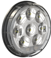
Part Number 0346471 12-24V DOT LED Heated White Reverse Light