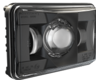
Part Number 0552571 12-24V DOT/ECE LED High Beam Headlight with Black Bezel