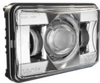
Part Number 0551381 12-24V DOT/ECE LED High Beam Headlight with Chrome Bezel