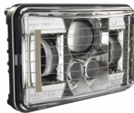
Part Number 0551771 12-24V DOT/ECE LED RHT Low Beam Heated Headlight with Chrome Bezel