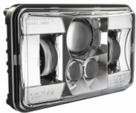
Part Number 0551371 12-24V DOT/ECE LED RHT Low Beam Headlight with Chrome Bezel