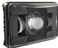
Part Number 0552571 12-24V DOT/ECE LED High Beam Headlight with Black Bezel