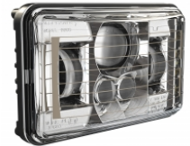
Part Number 0552091 12-24V ECE LED LHT Low Beam Heated Headlight with Chrome Bezel