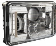
Part Number 0551771 12-24V DOT/ECE LED RHT Low Beam Heated Headlight with Chrome Bezel