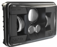
Part Number 0552561 12-24V ECE LED LHT Low Beam Headlight with Black Bezel