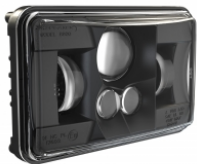
Part Number 0552551 12-24V DOT/ECE LED RHT Low Beam Headlight with Black Bezel