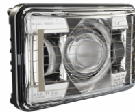
Part Number 0551781 12-24V DOT/ECE LED High Beam Heated Headlight with Chrome Bezel