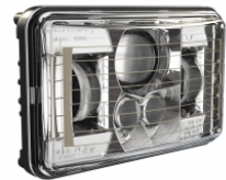
Part Number 0552091 12-24V ECE LED LHT Low Beam Heated Headlight with Chrome Bezel