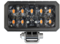
Part Number 1604241 12-24V LED Anti-Glare, 590Nm, Eco-Friendly Work Light with Pedestal Mount and Harness