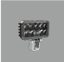
Part Number 1603921 12-24V LED Compact Work Light with Pedestal Mount