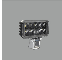
Part Number 1603932 36-80V LED Compact Work Light with Pedestal Mount (BULK with Harness)