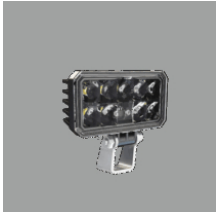
Part Number 1603931 36-80V LED Compact Work Light with Pedestal Mount