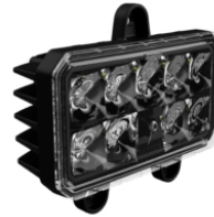
Part Number 1603971 36-80V LED Compact Work Light with Panel Mount