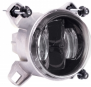
Part Number 0551201 12-24V ECE LED LHT Low Beam Headlight