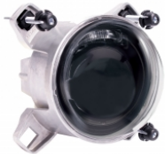
Part Number 0547751 12-24V DOT/ECE LED High Beam Headlight