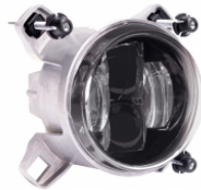
Part Number 0551211 12-24V DOT/ECE LED RHT Low Beam Headlight