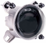
Part Number 0547751 12-24V DOT/ECE LED High Beam Headlight