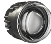
Part Number 0553071 12-24V DOT/ECE LED High Beam Headlight