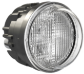
Part Number 0347941 12-24V SAE/ECE LED Turn Signal with DRL Function