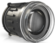
Part Number 0530091 12-24V DOT/ECE RHT LED High & Low Beam Headlight with Front Position