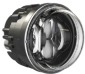
Part Number 0553091 12-24V ECE LHT LED Low Beam Headlight