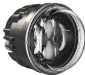
Part Number 0553101 12-24V DOT/ECE RHT LED Low Beam Headlight