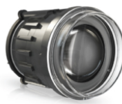
Part Number 0530101 12-24V ECE LHT LED High & Low Beam Headlight with Front Position