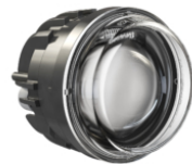
Part Number 0554381 12-24V DOT/ECE LED High Beam Headlight with Front Position