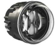
Part Number 0553081 12-24V DOT/ECE Symmetric LED Low Beam Headlight