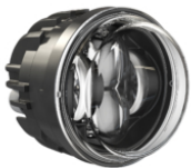
Part Number 0553081 12-24V DOT/ECE Symmetric LED Low Beam Headlight