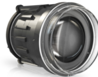
Part Number 0530321 12-24V SAE/ECE LED Symmetric 5-in-1 Headlight