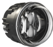
Part Number 0553091 12-24V ECE LHT LED Low Beam Headlight