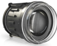
Part Number 3272011 ECE Motorcycle Wire Assembly without DI for Model 93