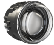
Part Number 0553071 12-24V DOT/ECE LED High Beam Headlight