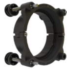
Part Number 8201021 90mm 3-Point Lock Mount for 3mm Mounting Frame