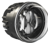
Part Number 0553101 12-24V DOT/ECE RHT LED Low Beam Headlight