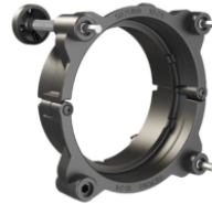
Part Number 8001461 90mm Light 3-Point Mount for 1.5mm Mounting Frame