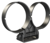
Part Number 8001621 Pedestal Mounting Bracket for Model 93 Double Lamp