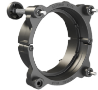
Part Number 8001471 90mm Light 3-Point Mount for 3mm Mounting Frame