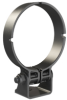
Part Number 8001601 Pedestal Mounting Bracket for Model 93 Single Lamp