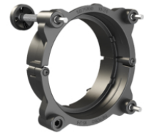
Part Number 8001471 90mm Light 3-Point Mount for 3mm Mounting Frame