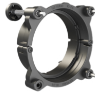
Part Number 8001461 90mm Light 3-Point Mount for 1.5mm Mounting Frame