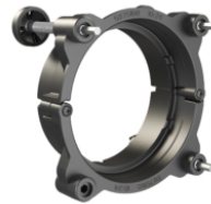
Part Number 8001461 90mm Light 3-Point Mount for 1.5mm Mounting Frame