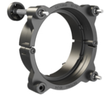
Part Number 8001471 90mm Light 3-Point Mount for 3mm Mounting Frame