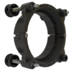
Part Number 8201021 90mm 3-Point Lock Mount for 3mm Mounting Frame