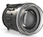
Part Number 0530101 12-24V ECE LHT LED High & Low Beam Headlight with Front Position