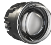
Part Number 0553071 12-24V DOT/ECE LED High Beam Headlight