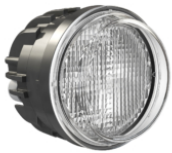
Part Number 0347941 12-24V SAE/ECE LED Turn Signal with DRL Function