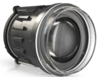
Part Number 0530091 12-24V DOT/ECE RHT LED High & Low Beam Headlight with Front Position