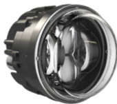
Part Number 0553101 12-24V DOT/ECE RHT LED Low Beam Headlight