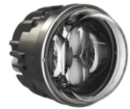
Part Number 0553081 12-24V DOT/ECE Symmetric LED Low Beam Headlight