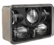
Part Number 0550941 12-24 ECE LED LHT High & Low Beam Headlight with FP & Panel Mount