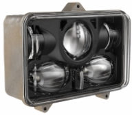
Part Number 0550281 12-24 ECE LED LHT High & Low Beam Headlight with FP & 3 Point Mount