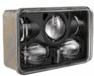
Part Number 0550931 12-24 DOT/ECE LED RHT High & Low Beam Headlight with FP & Panel Mount