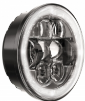
5.75" Round Headlights