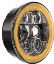
5.75" Round Headlights with Turn Signal