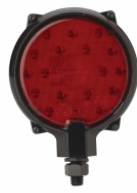
Part Number 0342781 12-24V ECE/SAE Single-Sided LED Stop & Tail Light with Guard