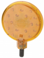
Part Number 0341681 12-24V SAE Double-Sided LED Turn Signal without Guard