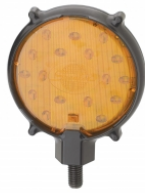
Part Number 0341931 12-24V SAE Double-Sided LED Turn Signal with Guard