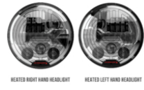
HEATED RIGHT HAND HEADLIGHT HEATED LEFT HAND HEADLIGHT

12V LHT ECE LED High/Low Beam Headlight - Chrome - 2 Light Kit