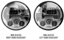
NON-HEATED RIGHT HAND HEADLIGHT NON-HEATED LEFT HAND HEADLIGHT