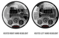
HEATED RIGHT HAND HEADLIGHT HEATED LEFT HAND HEADLIGHT

12V RHT DOT/ECE LED High/Low Beam Headlight - Chrome - 2 Light Kit