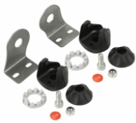
Part Number 8200271 Single End Bracket Kit for Model TS1000 Light Bars