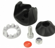
Part Number 8200291 Replacement End Bracket for Model TS1000 Light Bars