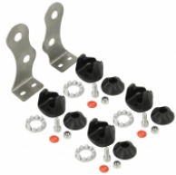
Part Number 8200281 Double End Bracket Kit for Model TS1000 Light Bars