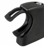
Part Number 8200301 Replacement C Bracket for Model TS1000 Light Bars