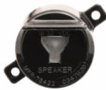
Part Number 0347522 24V Rear Blackout Stop Light - Bulk Qty (18 MIN)