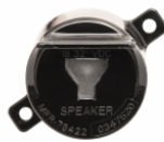
Part Number 0347522 24V Rear Blackout Stop Light - Bulk Qty (18 MIN)