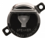
Part Number 0347522 24V Rear Blackout Stop Light - Bulk Qty (18 MIN)