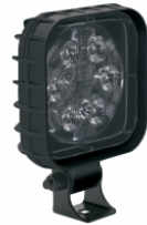
Part Number 1300041 12-110V LED Work Light with Trapezoid Beam Pattern & Integrated AMP Connector