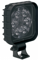
Part Number 1300011 12-24V LED Work Light with Trapezoid Pattern