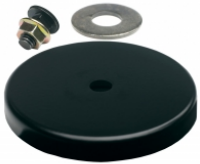
Part Number 8200011 Magnet Mount Kit for XD Series Work Lights