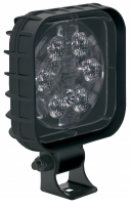
Part Number 1300091

12-110V LED Work Light with Trapezoid Beam Pattern & Integrated AMP Connector