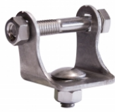
Part Number 8200101 Stainless Steel Mounting Kit for Work Lights & Marine Lights