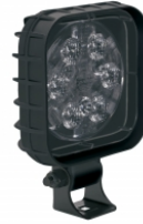
Part Number 1300091

12-110V LED Work Light with Trapezoid Beam Pattern & Integrated AMP Connector